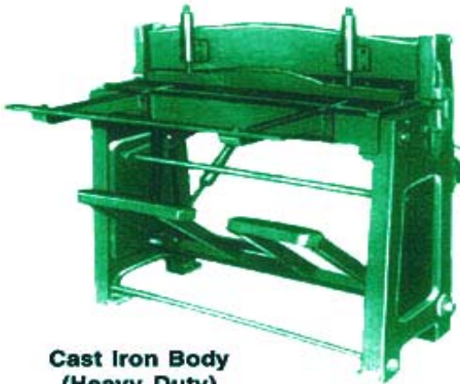
Cast Iron Body (Heavy Duty)